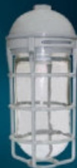
VP102-P ( Pendant Mount )