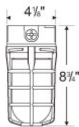
VP101-C (Ceiling Mount)