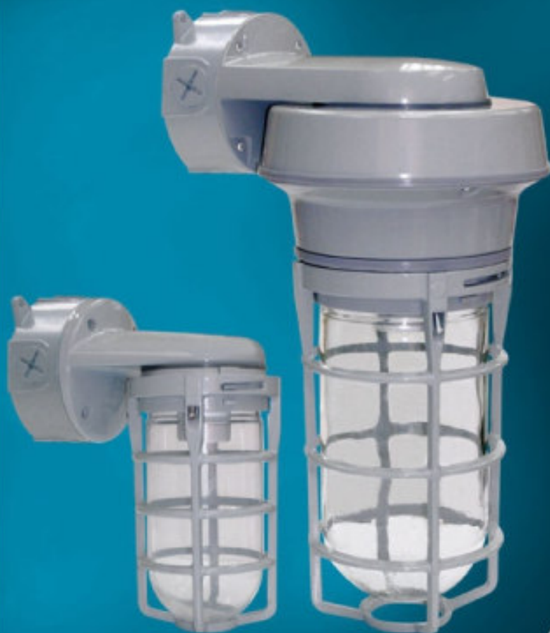
VP101-W ( Wall Mount )