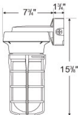
VP102A-W (Wall Mount)