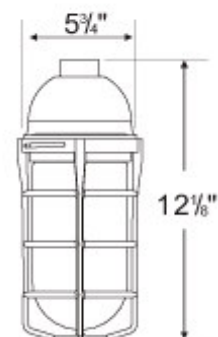
VP102-P (Pendant Mount)