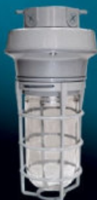
VP102A-C ( Ceiling Mount )