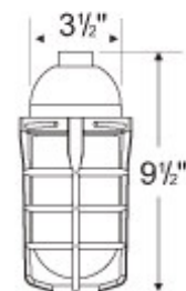
VP101-P (Pendant Mount)